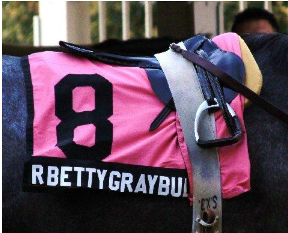
Betty's saddlecloth in the Iroquois Stakes on NY Showcase Day

So when she went into the gate at PARX on December 4th to race one mile around two turns, she was more or less performing to continue her racing career. She did not disappoint, as she won easily with her patented last-to-first charge.