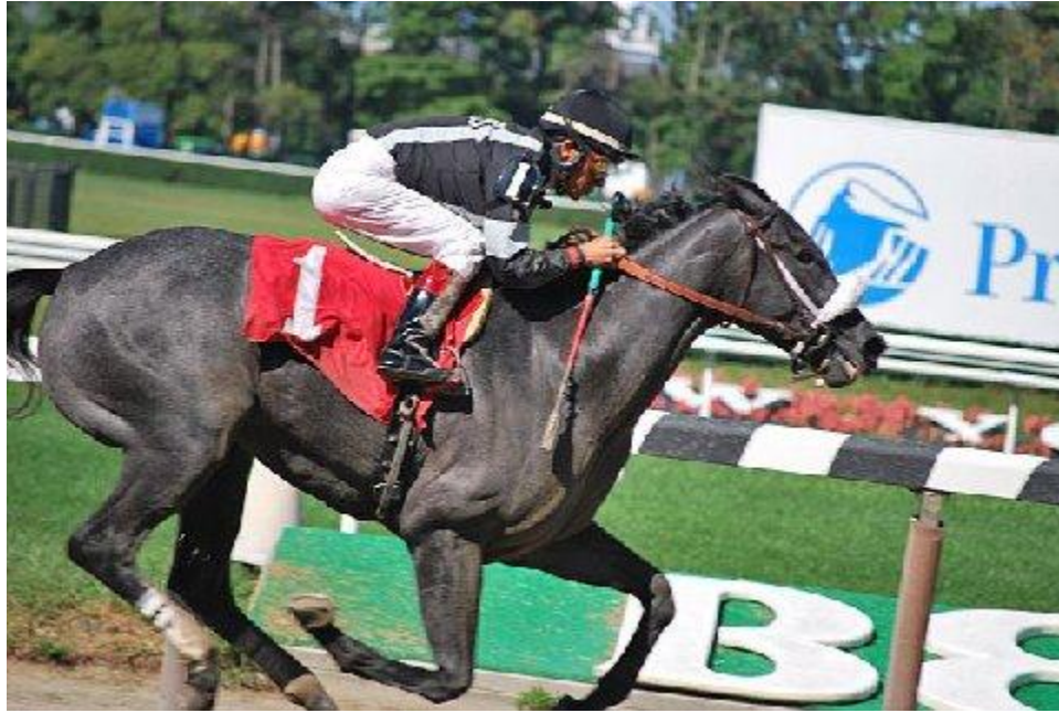
R Betty Graybull on cruise control breaking her maiden

In her next start against MSW company at Belmont Park, she won easily. She followed that up at Monmouth Park, where she won the $200,000 NATC Futurity Stakes. She ended her two-year old campaign with a 2nd to eventual Grade-1 winner Just Jenda.