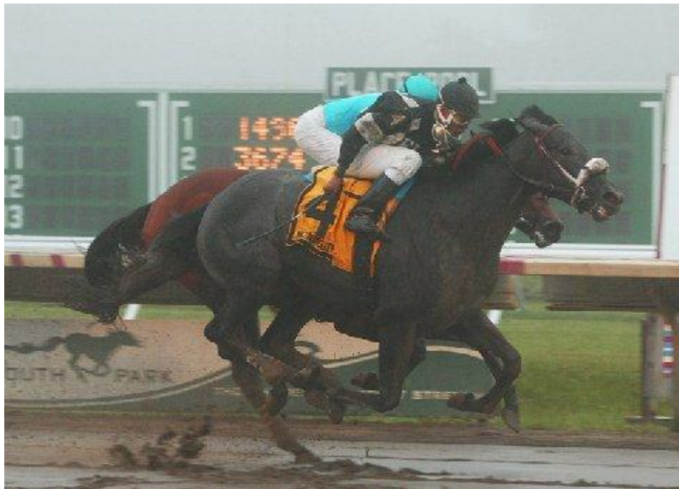
Betty winning the 200K NATC Futurity, beating graded winner Kays and Jays

In her next start against MSW company at Belmont Park, she won easily. She followed that up at Monmouth Park, where she won the $200,000 NATC Futurity Stakes. She ended her two-year old campaign with a 2nd to eventual Grade-1 winner Just Jenda.