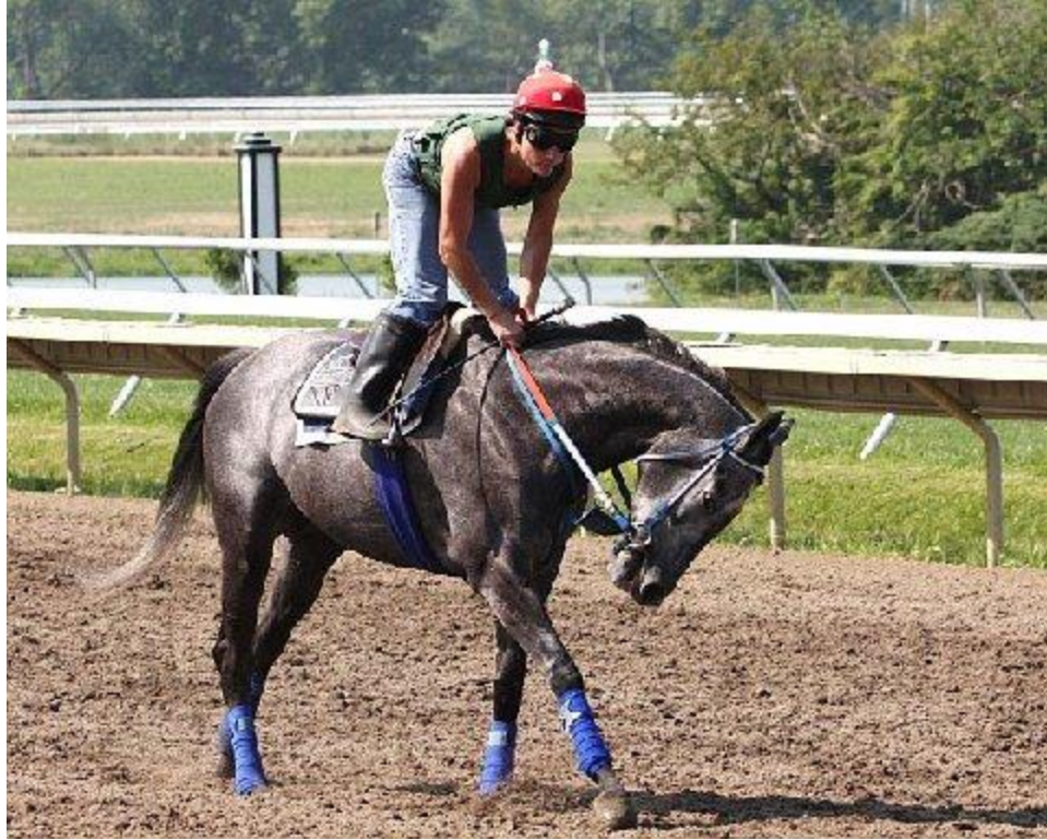
Betty this past summer with her head regally bowed training

Believe me her running style is not made for sprinting. However, Betty has faced some of the best fillies and mares in non-graded sprint stakes. She ran against the very talented NY-bred Grade 1-winning filly Rightly So, who was the morning-line favorite for the 2010 Breeders Cup Sprint before being scratched on the day of the race.