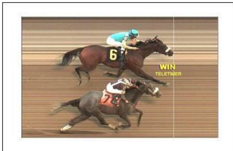
Betty, on the outside, runs out of room against eventual Grade-1 winner Rightly So

Believe me her running style is not made for sprinting. However, Betty has faced some of the best fillies and mares in non-graded sprint stakes. She ran against the very talented NY-bred Grade 1-winning filly Rightly So, who was the morning-line favorite for the 2010 Breeders Cup Sprint before being scratched on the day of the race.